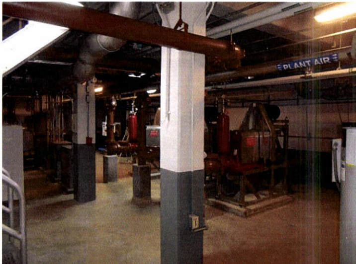
January 19, 2015, Upgraded, painted and restored control building